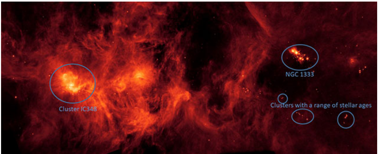
This annotated image of the Perseus Molecular Cloud, provided by NASA's Spitzer Space Telescope, shows the location of various star clusters, including NGC 1333.