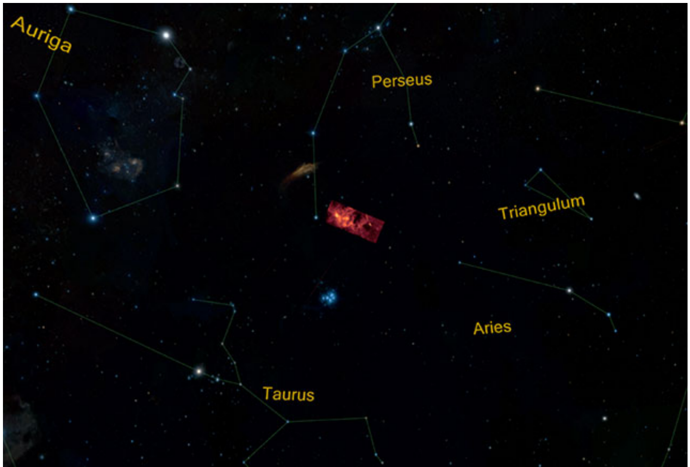
This image from NASA'S Spitzer Space Telescope shows the location and apparent size of the Perseus Molecular Cloud in the night sky. Located on the edge of the Perseus Constellation, the collection of gas and dust is about 1,000 light-years from Earth and about 500 light-years wide.