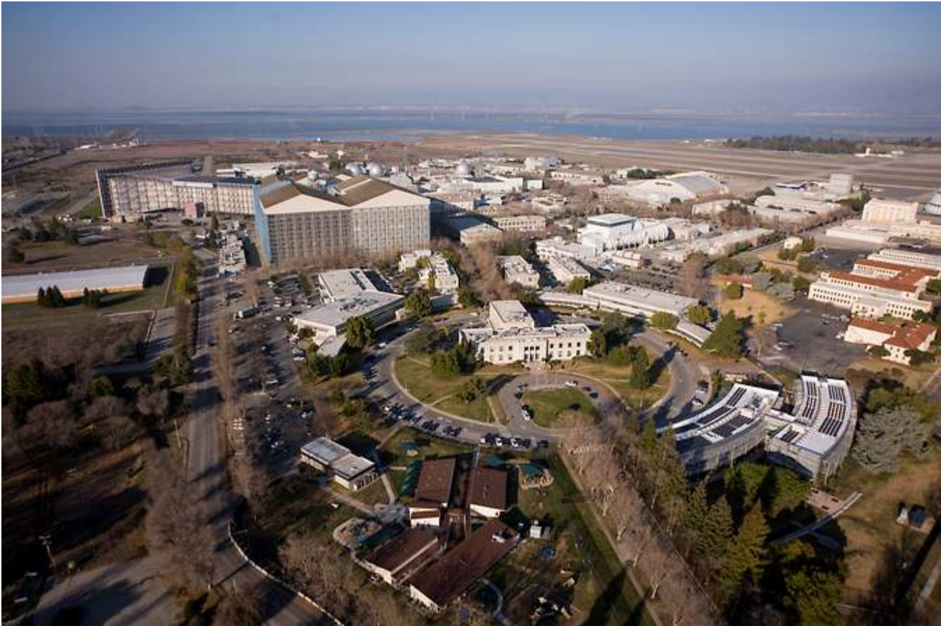
An aerial photo of NASA's Ames Research Center.