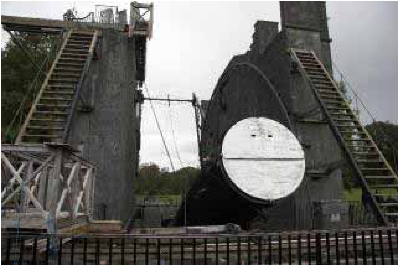
The Leviathan Telescope at Birr Castle, view from the south in the rest position.

It is not likely that ancient observers used Stonehenge for astronomical predictions. More likely, any astronomical observations made at Stonehenge were of a simple kind carried out for religious and ritual practices.