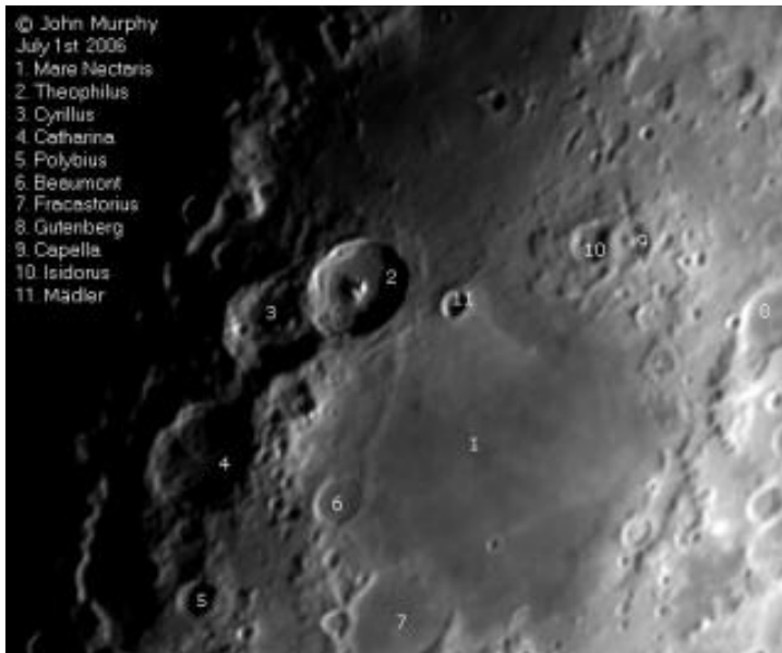
Used with permission. Rosse is the small (unnumbered) crater in Mare Nectaris.

Moon , is easily visible for much of the lunar month. I have enjoyed viewing it as a bright speck on the waxing crescent terminator, as part of the vivid lunar tapestry of the full Moon, and at sunset on the waning Moon a few days after full.