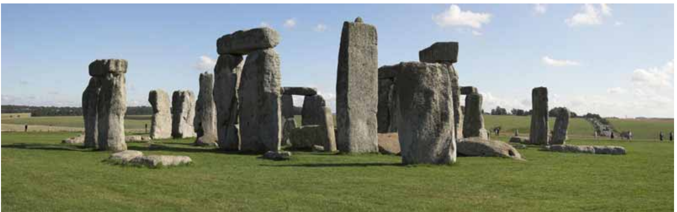
Mojo assembled this panorama from four individual pictures. More on the photo page .

Longitude 1°50'W, Latitude 51° 11'N – Stonehenge, Wiltshire, UK