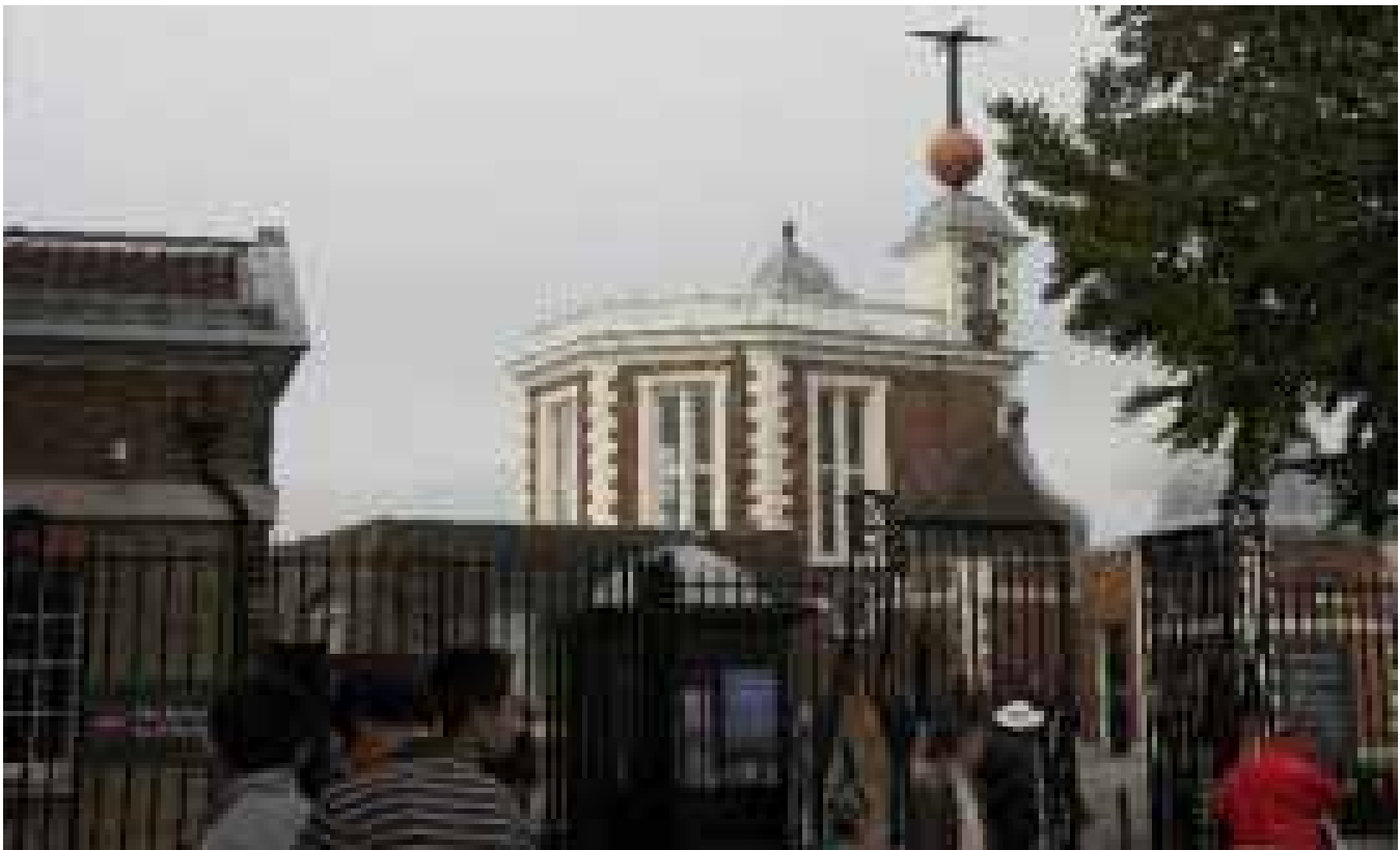
The octagon room at Flamsteed house, and time signal ball, at the Royal Greenwich Observatory

Longitude 0° 0', Latitude 51° 28'N – Royal Observatory Greenwich, London, UK