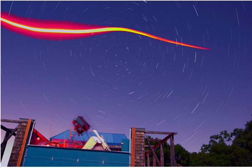
Photo star trails

Are you photon deprived from the weather we're having? You may be a candidate for an evening with a very large telescope. SFAAer's can get recharged at Fremont Peak on May 19th and 20th. We have reserved the Observatory Friday evening for an exclusive private gathering of members from the SFAA, as we've done the previous years.