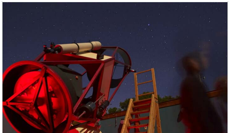
Photo of a stargazer