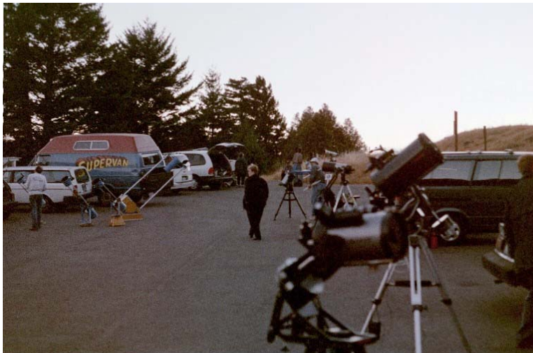
Mt. Tam Star Party – ready, set, observe