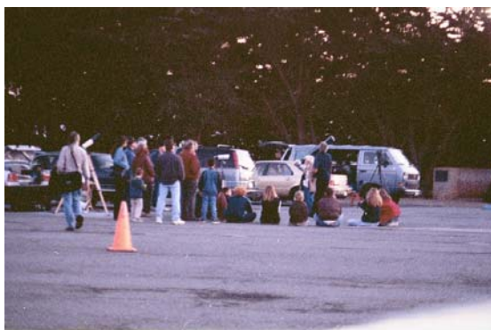
City Star Party – the audience is listening

Dr. Faber is a member of the "Seven Samurai" -- the fond title given to the group of astronomers who first detected that the expansion of the universe had large-scale irregularities in it (indicating that the universe was lumpier than had been thought.) She is also a part of the team that is showing how common giant black holes are in the centers of galaxies. In addition, she serves on the Board of Trustees of the Search for Extraterrestrial Intelligence Institute, and is in demand as a speaker around the world.